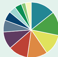
Net Asset Value Mix